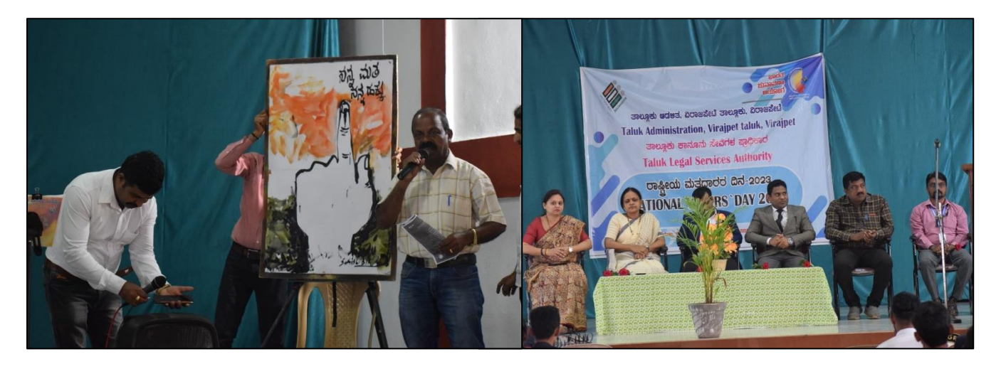
Election Awareness March

The event concluded with a pledge-taking ceremony where students and faculty committed to upholding the values of harmony and national integration.